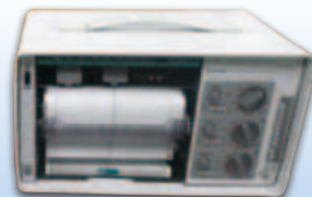
[ Previous HIOKI model: EPR-3500s ]