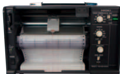
Pictured: PR8111 (1-pen model)