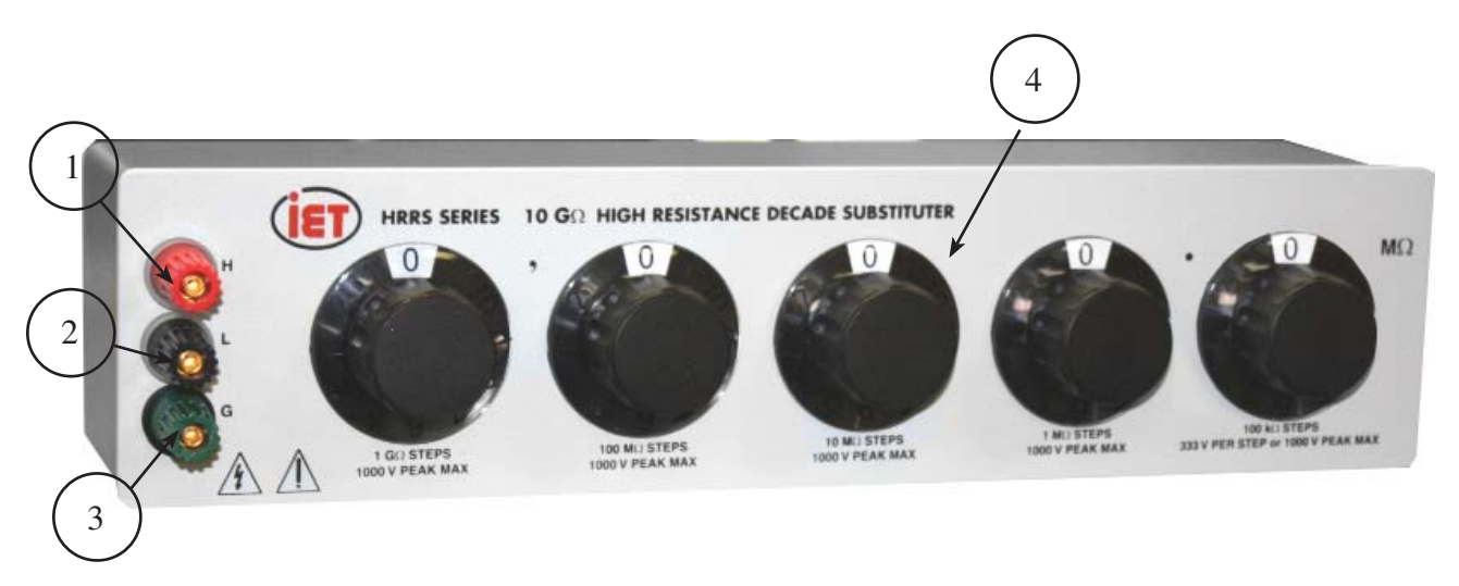
Figure 4-2: Replaceable Parts