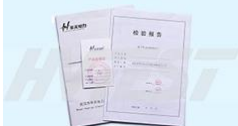
Manual, Report, Certificate