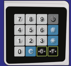
Simple and easy operation