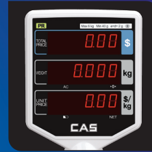
Clear LED Display