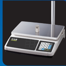
Dual interval technology