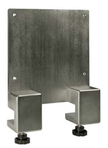
Item #072606 For All LTT Models