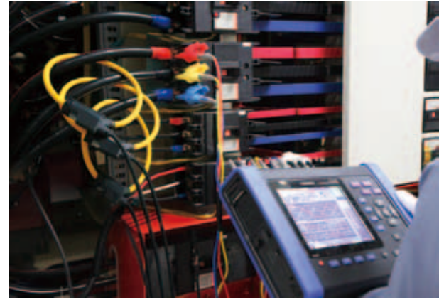
Use with a power quality analyzer or power meter

Easy to loop around, even in confined spaces