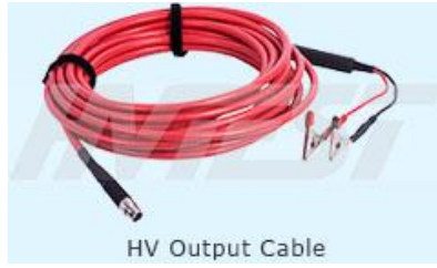
HV Output Cable