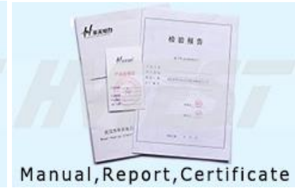
Manual, Report, Certificate