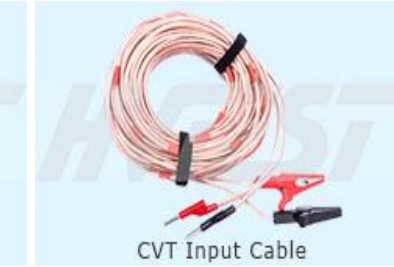
CVT Input Cable