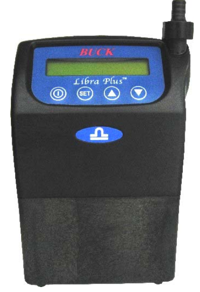
Powerful Personal Sampling Pump