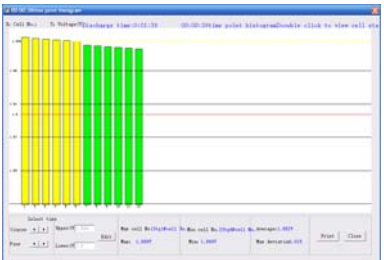
K-3980 PC Software