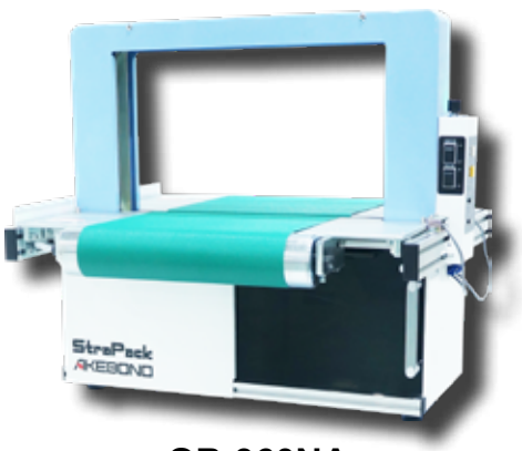
OB-360NA *driven belt table